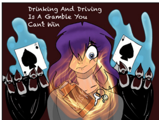
Jade Wolff, 7 th grade, won the computer-generated art category.