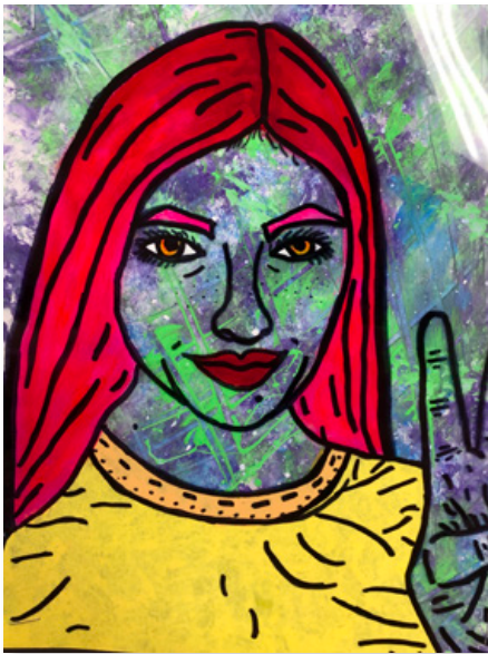
"Pop Art Self Portrait"